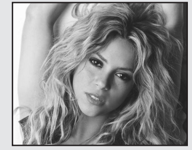
Honda Center Anaheim 10/25/10 $40